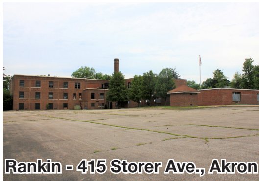
Rankin - 415 Storer Ave., Akron

AUCTION BY ORDER OF: Akron City School Board