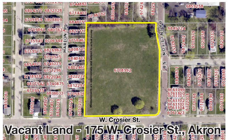
Vacant Land - 175 W. Crosier St., Akron

Information is believed to be accurate but not guaranteed.