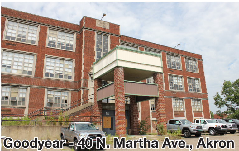
Goodyear - 40 N. Martha Ave., Akron

AKRON SCHOOL BOARD BUILDING: 10 N. MAIN ST., AKRON, OHIO 44308