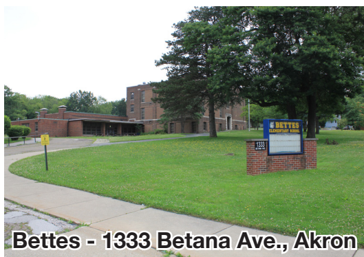
Bettes - 1333 Betana Ave., Akron