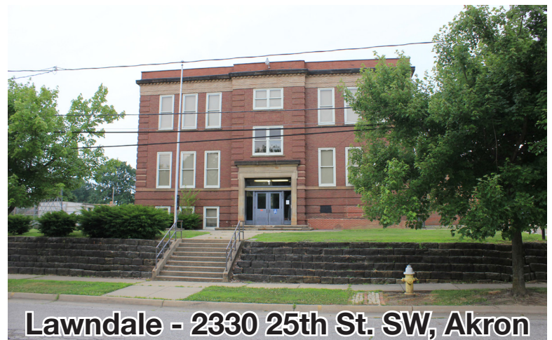
Lawndale - 2330 25th St. SW, Akron