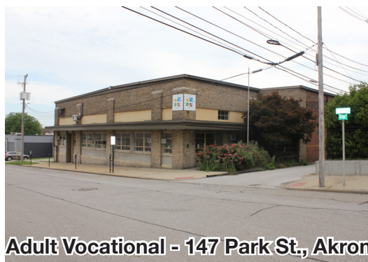
Adult Vocational - 147 Park St., Akron