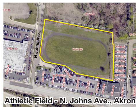
Athletic Field - N. Johns Ave., Akron