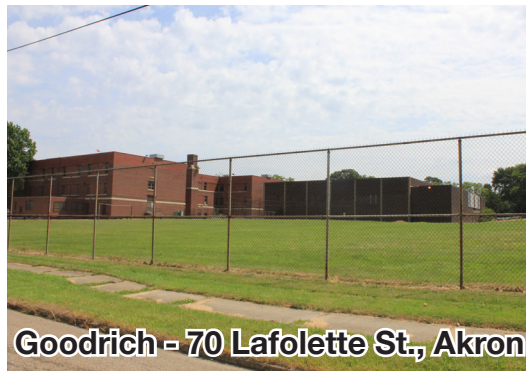
Goodrich - 700 Lafalette St., Akron